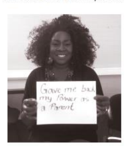
Check out family links, or g.uk for more information on The Parenting Puzzle book and the Nurturing Programme

"The atmosphere was really relaxed. No-one judged anyone and everyone was listened to and respected."