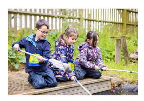
Ofsted November 2021

'One parent, reflecting the views of many others, said that their children are becoming well-rounded individuals who love learning. The parent also said, 'I couldn't ask for more'